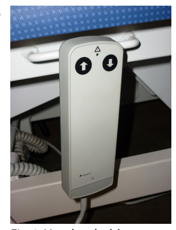
Fig 4: Handset holder

The Plinth has an integral handset holder on both sides of the seat section so that the handset can be stored when not in use (as seen in Fig 4).