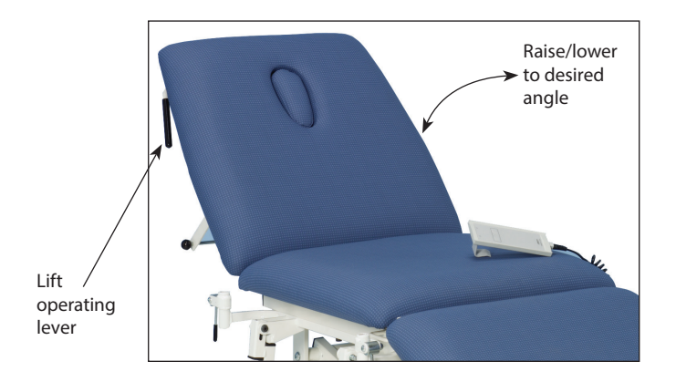
Fig 5: Adjusting the backrest