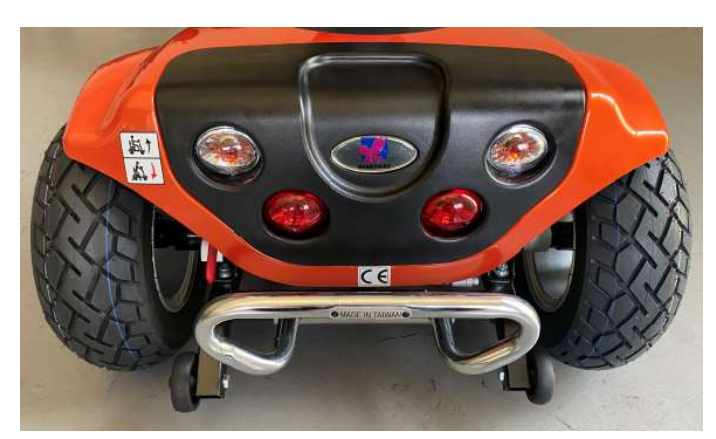
Up = Electromagnetic Brake is engaged (Drive Mode)