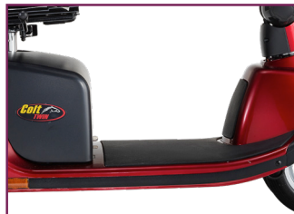
Large Amount of Leg Room