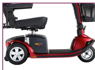
Exclusive & Stylish Low Profile Tyres