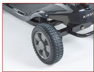
Super soft tyres