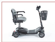
Long floor pan