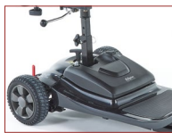
Air safe Lithium battery