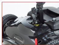
Quick release T-bar handle