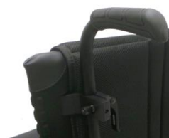
XFF 030204 Push handles, height-adjustable