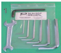
XFF090000 Tool kit