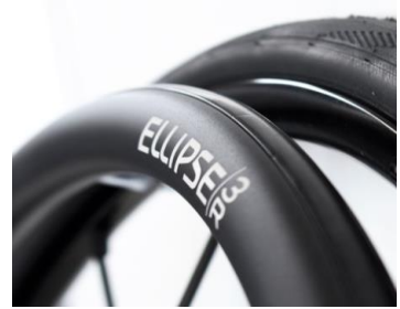
XFF070212 Handrims Ellipse 3R