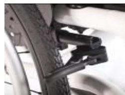
XFF060003 Compact brake