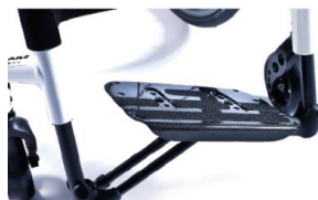
XFF050027 Footboard platform, lightweight, carbon fibre, auto folding