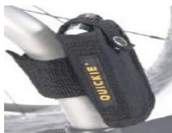
XFF090026 Mobile phone pocket