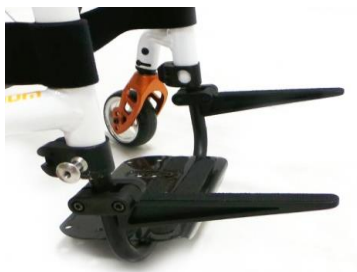
XFF090019 Caddy, flip-up bracket for bags