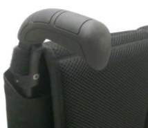
XFF 030201 Push handles long