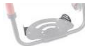
XFF050127 Adjustable side protection