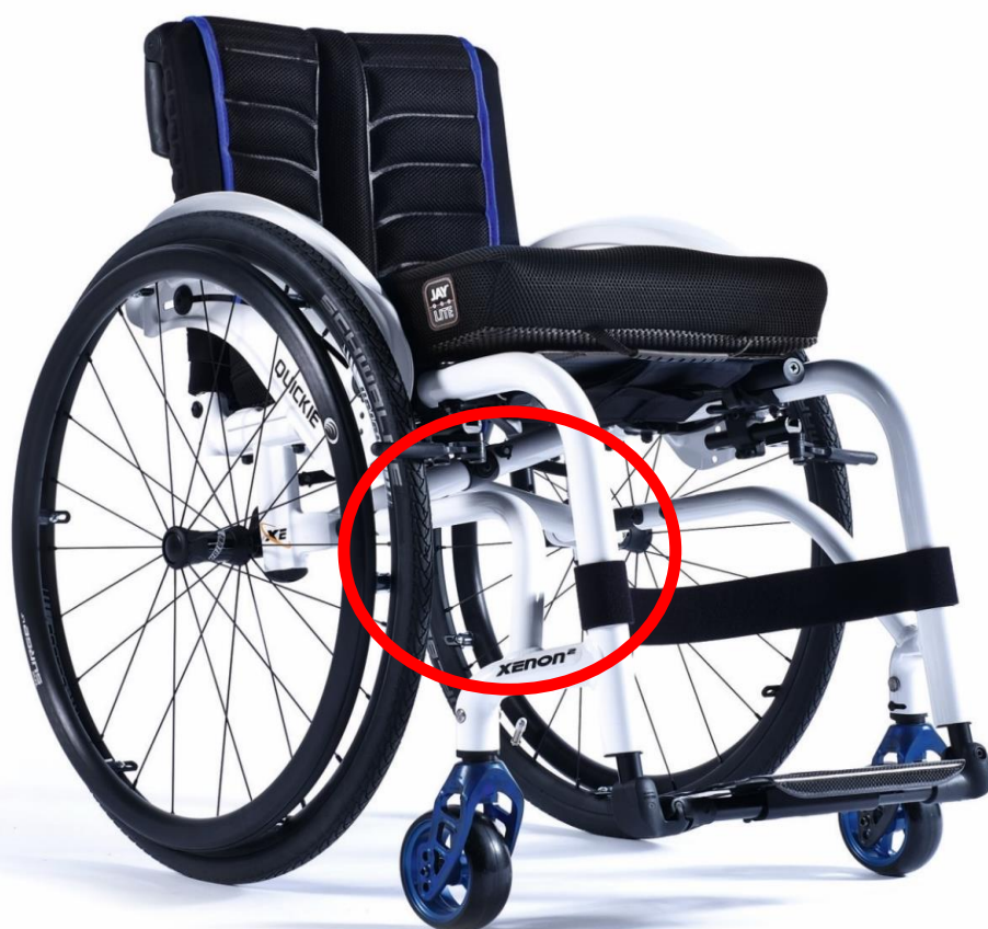
XFF090020 / 21 Hybrid frame