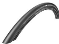
XFF070107 Schwalbe One