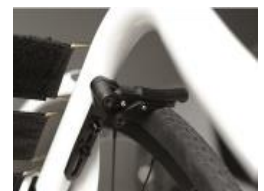
XFF060004 Lightweight compact brake