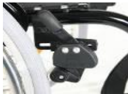
XFF060002 Knee lever brake