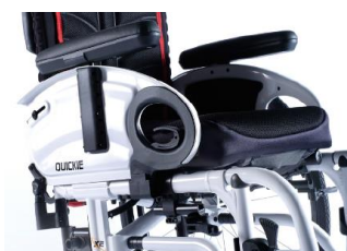
XFF04000x Desk sideguard, armpad, flip-up, removable