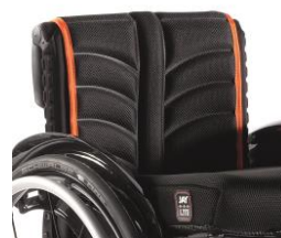
XFF 030317 EXO PRO backrest sling