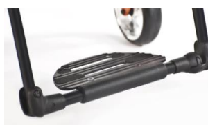
XFF050059 Footboard platform, performance