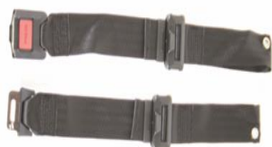
XFF 090018 Lap belt with buckle, metal