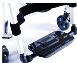
XFF050132 Footboard platform, lightweight, carbon fibre