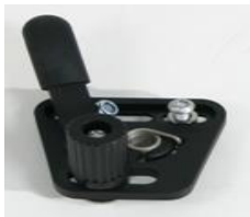
XFF060001 Standard brake