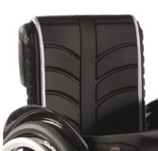
XFF 030316 EXO backrest sling