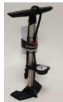
XFF090024 High pressure pump