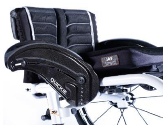
XFF040104 Carbon fibre, cold weather protection, fender