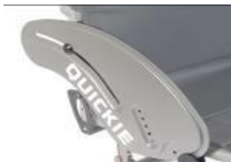
XFF040102 Aluminium, cold weather protection