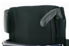
XFF 030203 Push handles, fold-down