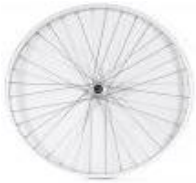
XFF070001 Universal wheel