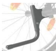
XFF090001 Tip assist