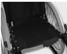
XFF 020002 Seat sling with 1 utility bag