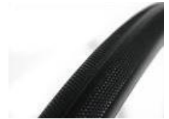
XFF070102 Tyre, puncture proof