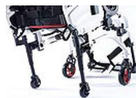
XFF090010 Transit wheels