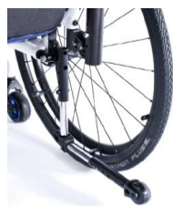
XFF090004 Anti-tip tubes, swing away