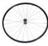
XFF070003 Lightweight wheel