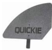
XFF040107 Composite sideguard detachable