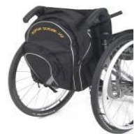
XFF090030 Back pack