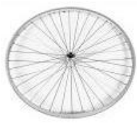
XFF070002 Design wheel