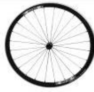
XFF07000 Proton wheel