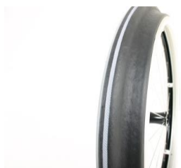
XFF070208 Handrims Maxgrepp