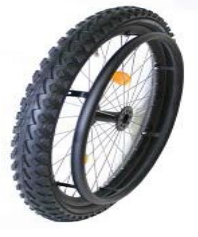
XFF07010 Mountainbike wheel