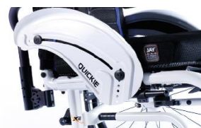
XFF040103 Aluminium, cold weather protection, fender