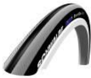
XFF070101 Schwalbe Right Run