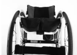
XFF 020003 Seat sling with utility bags 2