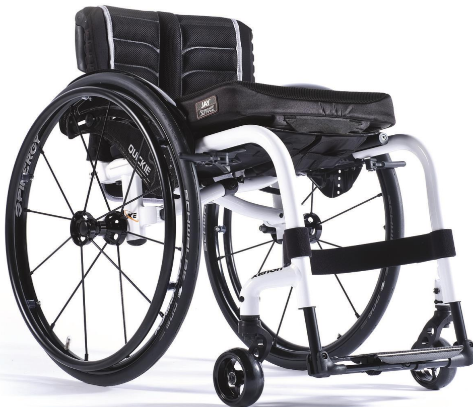
XFF010012 / 13 Open Frame