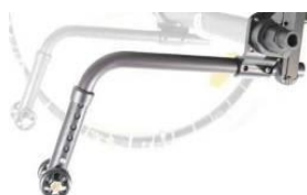
XFF090050 Anti-tip tubes, plug in, pair