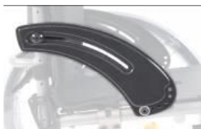
XFF040101 carbon fibre, cold weather protection, slim