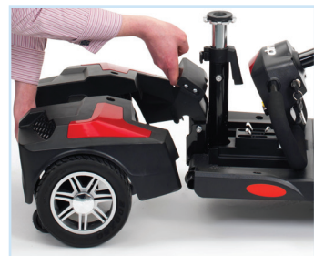
Splits easily in seconds.