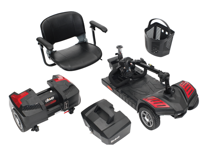
Splits easily for storage and transportation.