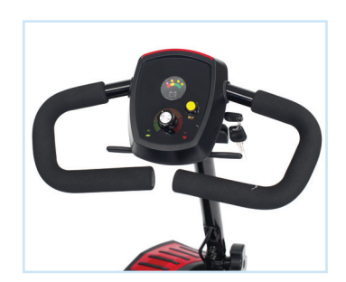
Delta Bars as standard.