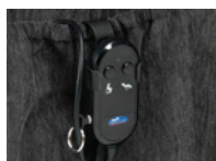
Two Button Handset