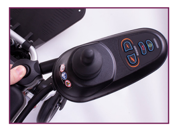
Micon Control System