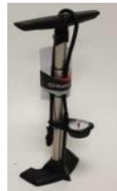
XFF090024 High pressure pump