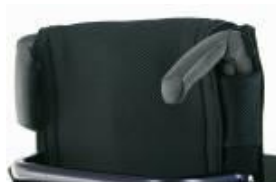
XFF 030203 Push handles, fold-down