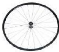
XFF070003 Lightweight wheel