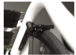
XFF060004 Lightweight compact brake