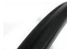
XFF070102 Tyre, puncture proof