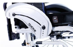
XFF040103 Aluminium, cold weather protection, fender