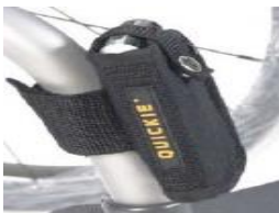
XFF090026 Mobile phone pocket