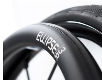
XFF070212 Handrims Ellipse 3R