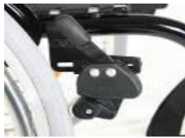
XFF060002 Knee lever brake