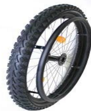
XFF07010 Mountainbike wheel