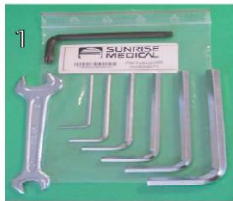
XFF090000 Tool kit