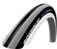
XFF070101 Schwalbe Right Run