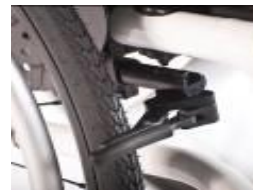
XFF060003 Compact brake