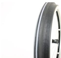
XFF070208 Handrims Maxgrepp