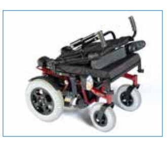
Fold down backrest For easy transportation and storage