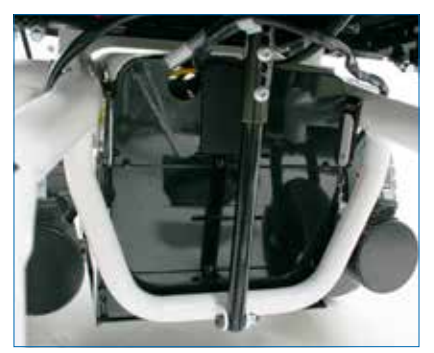
Powered seat tilt Tango offers powered seat tilt from 3 to 25° as standard, ensuring comfort and pressure redistribution is easy and quick to achieve