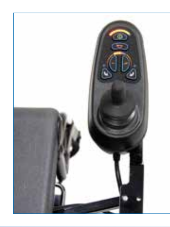
Parallel swing-away controller (standard)