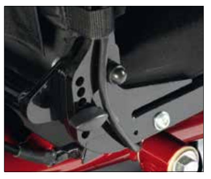
Manual reclining back The backrest recline can be adjusted from -3° to 12° in 3° increments without tools