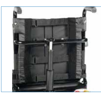
Tension & height adjustable back Backrest upholstery is tension adjustable for improved user comfort and can be adjusted to 45cm (17.7"), 47.5cm (18.7") and 50cm (19.7") height