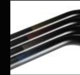
Frame graphic Floating dots