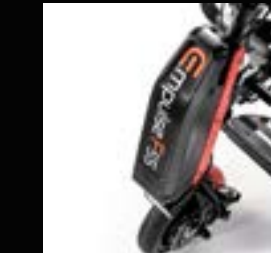
Empulse F55 bundling