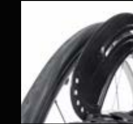
Slim style sideguard