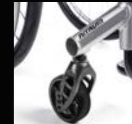
Castor fork, Carbotechnology®