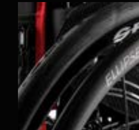
Handrims, Ellipse 3R, black