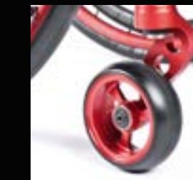
Castor fork, aluminum, one-arm

Use our online visualiser to create the QUICKIE Nitrum of your dreams!