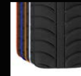
EXO PRO backrest sling