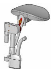
Amputee Support Pad