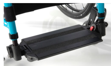
Platform, angle and depth adjustable; flip up, aluminium with locking system