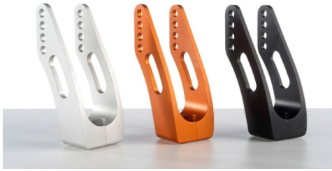
Fork Aluminium, black, orange & silver