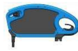
Desk armrest without armpad