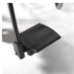
Divided footplate aluminum