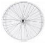
Universal cross spoked