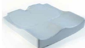
Jay Easy Visco (picture shown without upholstery)