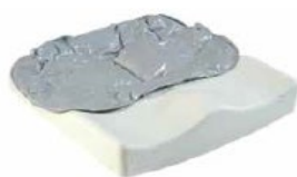
Jay Easy Fluid (picture shown without upholstery)