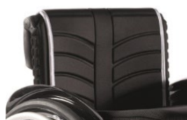
EXO backrest sling