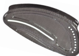
Sideguard carbon with fender