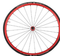
Lightweight wheel, anodized red