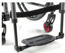
Platform footplate lightweight angle & depth adjustable composite flip up