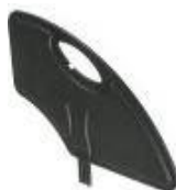
Sideguard composite detachable