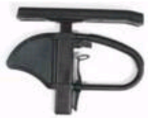
Single post height adjustable armrest