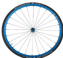
Lightweight wheel, anodized blue