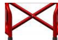
Frame FF 85° (integrated footrest), inset (20 mm on each side), active