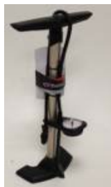
High pressure pump