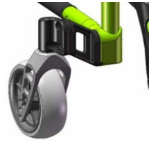
Expansion kit, designed for hemiplegic users