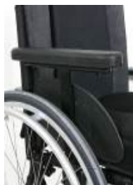
Single-post sideguard, depth adjustable, tool height-adjustable