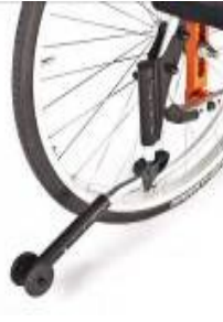
Anti-tip swing away