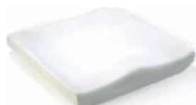
Jay Basic (picture shown without upholstery)