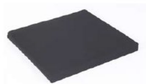
Seat cushion, cover with zipper, black