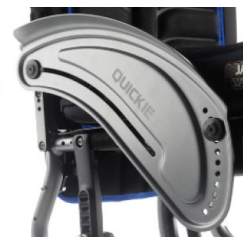
Sideguard alu with fender