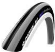
Right Run Tyre