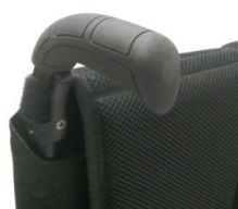
Push handles long