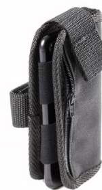
Mobile phone pocket