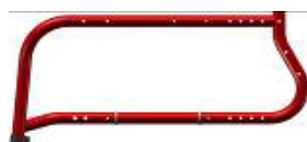
Life FF 85°