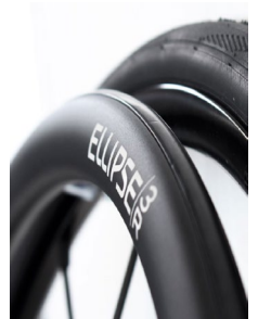
Ellipse 3R Handrim