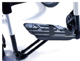
Footboard platform, lightweight, carbon fibre, auto folding