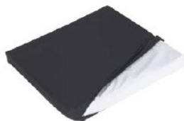
Seat cushion, climate membrane water-resistant, cover with zipper, black