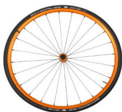
Lightweight wheel, anodized orange