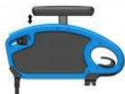
Desk armrest, height adjustable, short armpad(25cm)