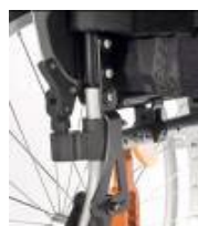
Angle adjustable back -12° to 12°