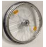
Drum brake wheel