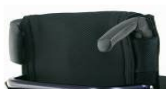
Fold down push