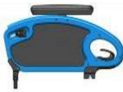
Desk armrest, fixed height, short armpad(25cm)