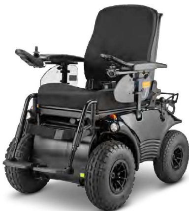
Optimus 2 8mph