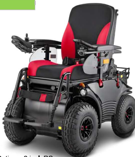
Optimus 2 incl. RS Edition