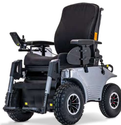
Optimus 2 6mph