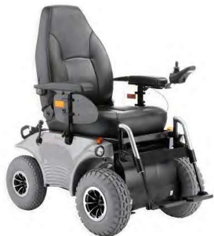
Optimus 2 Silvermetallic