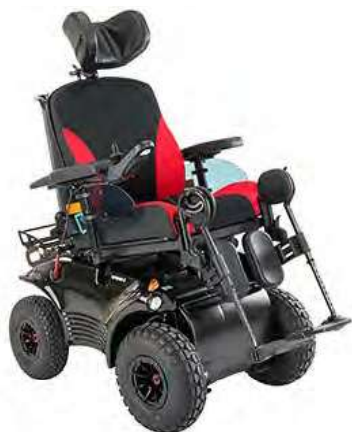
Optimus 2 incl. RS with Tilt Edition