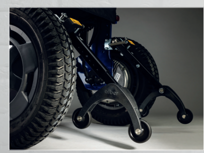
Premium anti-tipper option provides jack-up function for quick release of wheels