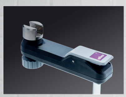
Lightweight Alber swivel arm