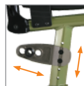
Adjustable rear wheel position